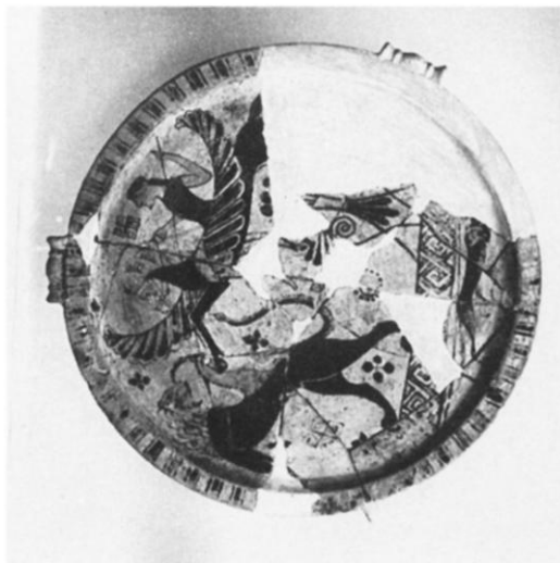
(d) Naxian (?) from Thasos, Bellerophon.