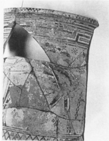
(a) Naxian, from Naxos, Aphrodite amphora.