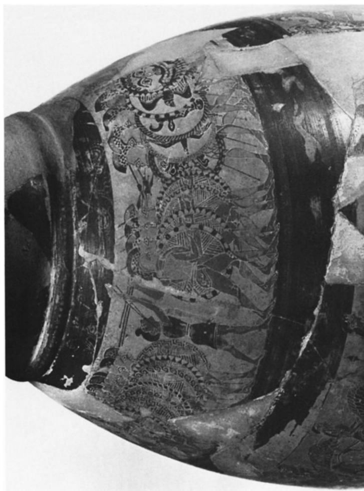
(a) Protocorinthian, Chigi vase.