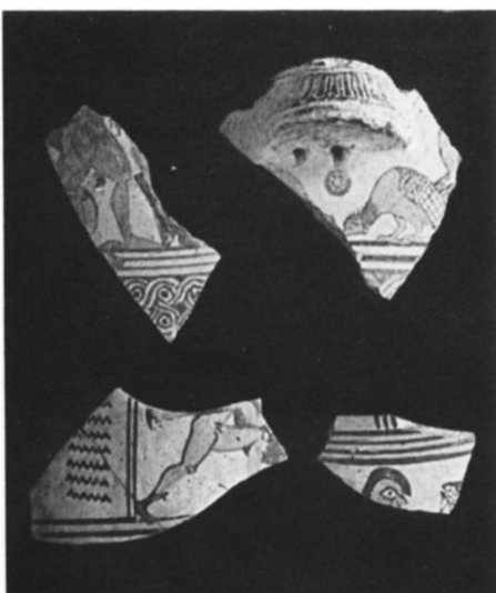
(c) Local polychrome sherds from Megara Hyblaea.