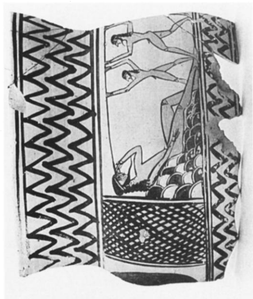
(c) Protoargive krater, Blinding of Polyphemus.