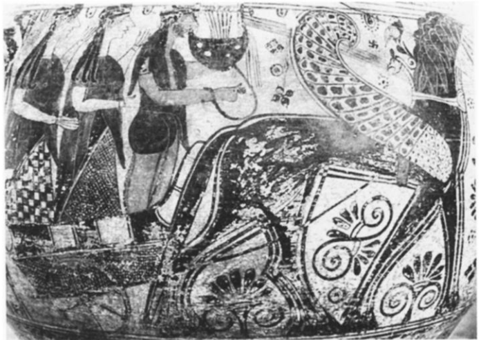
(b) 'Melian' (made on Paros?), Apollo amphora.